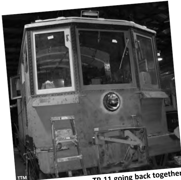
TP-11 going back together