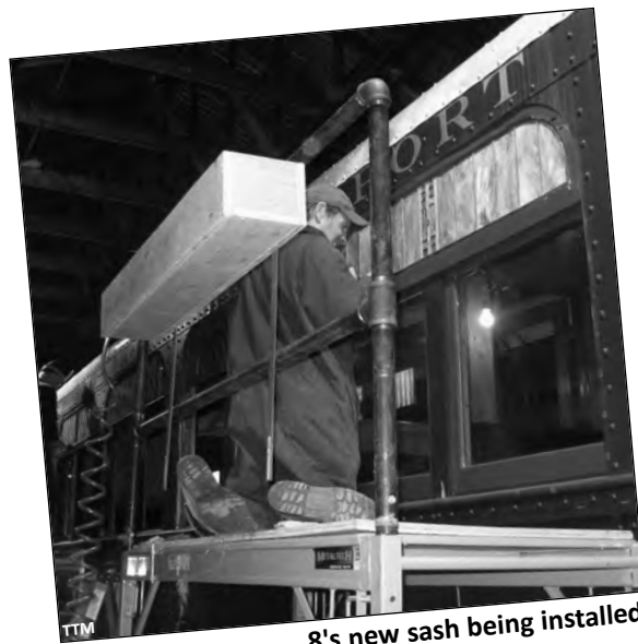
8's new sash being installed

Windows, windows, windows. The past two months have seen some incredibly intense progress. All sixteen new mahogany upper sash have now been completed and a total of nine are now installed. All eight on the south side and one on the north. Concurrent with the work on the uppers, 18 new lower sash have been completed with 18 more in various stages of production. New safety glass has been purchased for the new lower sash and all sixteen windows on the south side will have been replaced by press time. The goal is to have the remaining seven uppers and 16 lowers installed on the north side by the end of April.