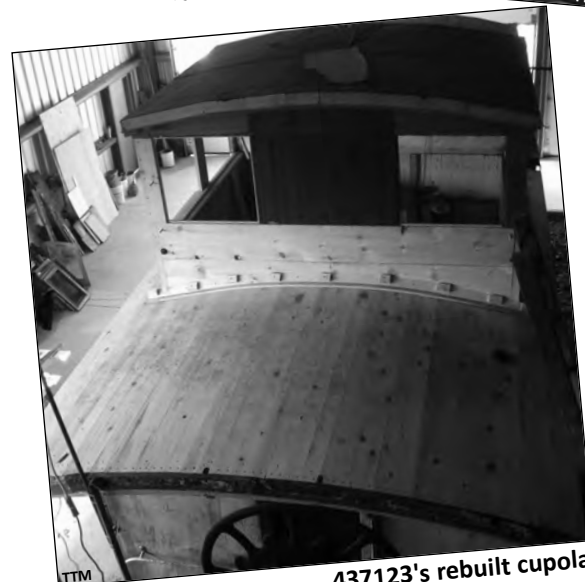
437123's rebuilt cupola

Work on the caboose has continued throughout the winter. A rotten section of the floor was removed and replaced. The cupola was dismantled and completely rebuilt and the short section of the roof had new boards installed. Overall the work is progressing well and should be substantially complete by May.