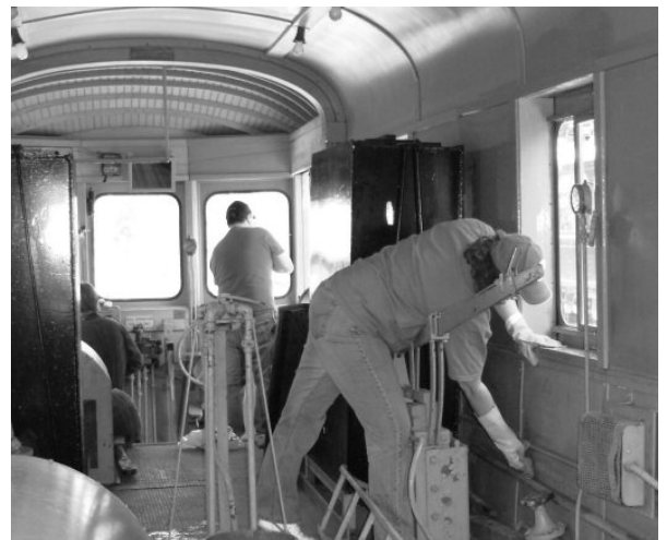
Members of the Ottawa 696 group cleaning W-28.